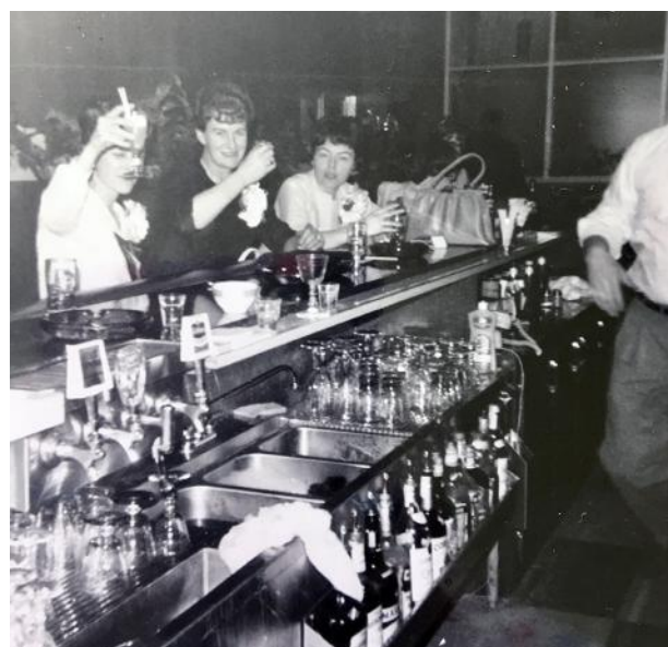
Top: An interior photo of Pheasant Bar